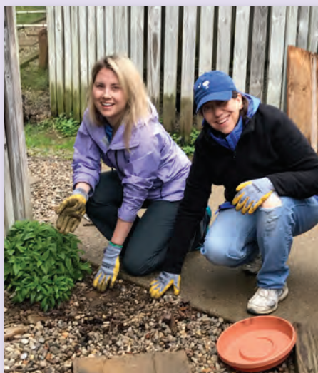
Recent WSCM service project

Our club focuses on social, charitable, cultural and educational services for, and around, the St. Matthews area.