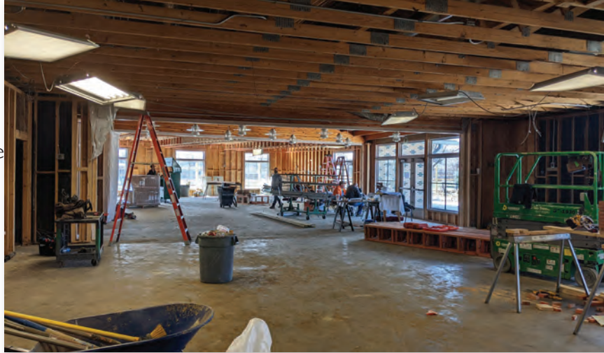
Phase 2—inside the Community Center