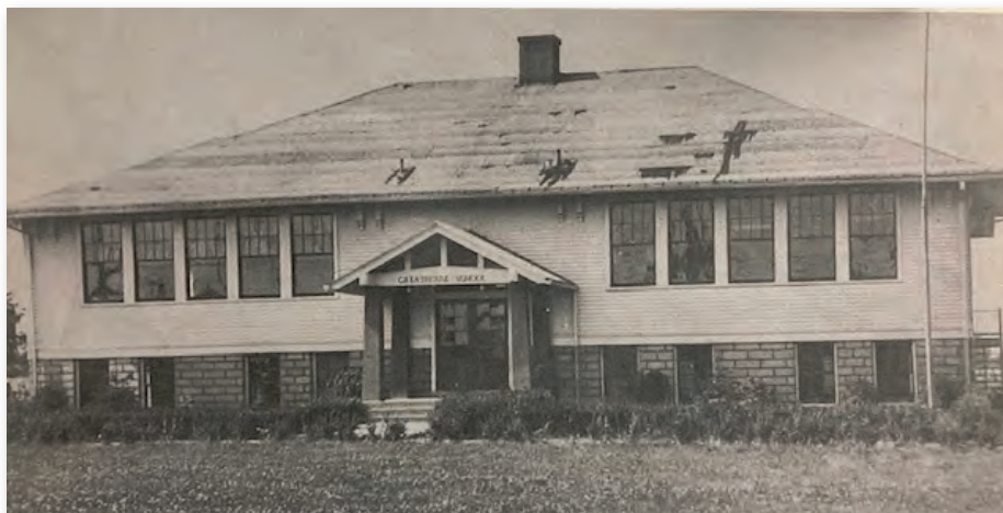
Photo credit: St. Matthews – The Crossroads of Beargrass by Samuel W. Thomas (Photo 1923)

This feature spotlights a moment in time when our City looked a lot different. Where do you think this photo was taken? See page 8 to solve this issue's Hometown History Mystery.