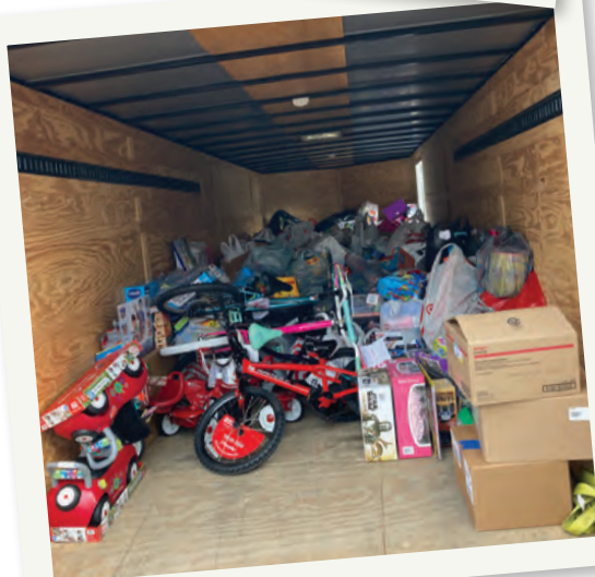
Toy donations on trucks

Independence Bank is no longer accepting donations of items, however, they will accept monetary donations for the accounts below: