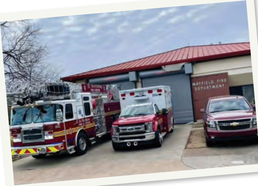
St. Matthews Fire & Rescue in Mayfield, Kentucky