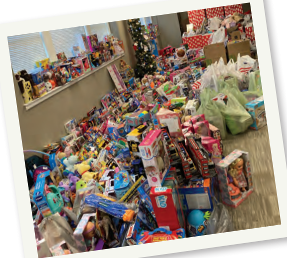
City Council chambers, first day of collection

St. Matthews has once again proven itself to be a caring community to those in need.