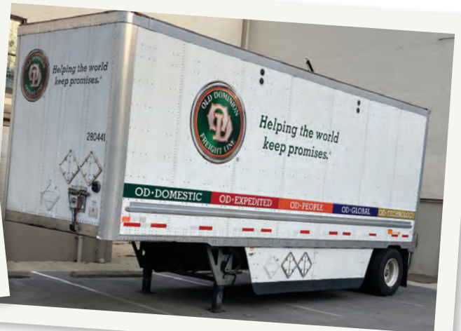
One of the trailers loaded with toys