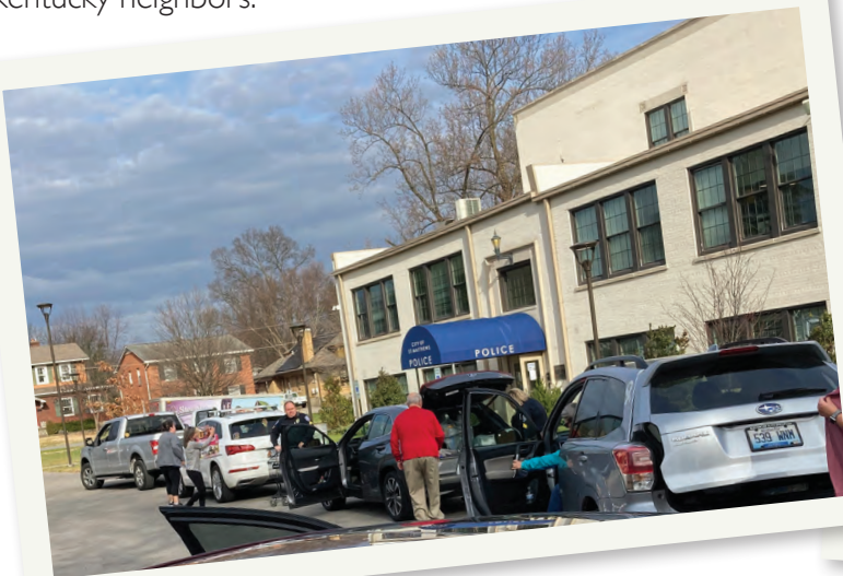
Line of cars with donations outside City Hall