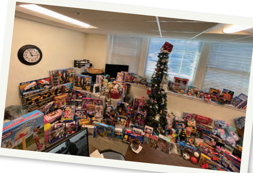
Donations of toys received in the first three hours at City Hall!