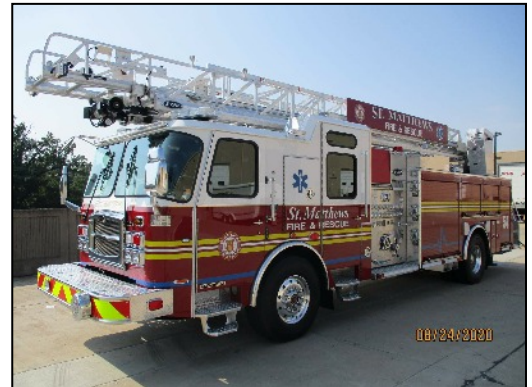
St. Matthews Fire Protection District bought a new fire truck in October, which was brought here from Florida..

If you have questions about fire prevention, contact the St. Matthews Fire Protection District at 502-893-7825. They have the experience you need.