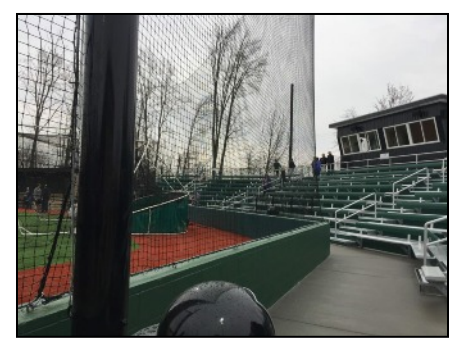
The new stadium boasts 500 bleacher seats and a standing room only area.

as a concrete drive for emergency vehicles.