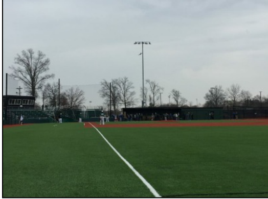
Newly built Voll Field, looking down first base line.

Voll Field nears completion Though the new Voll Field is awaiting some finishing touches, Trinity High School baseball