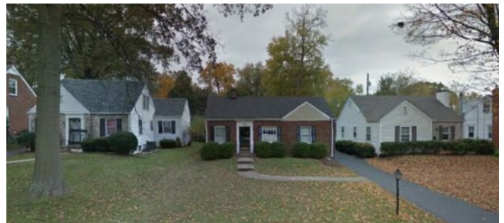
The Jefferson County PVA assessed St. Matthews houses this past summer for the first time since 2007.