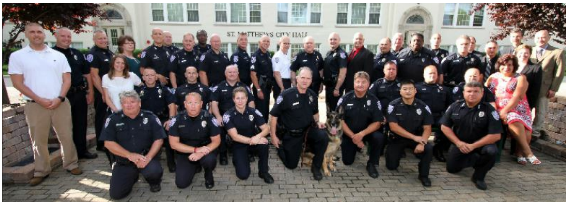
St. Matthews police officers and staff vow to serve and protect the public every day.

Cars parked on streets should be facing the same direction as the flow of traffic on their side and should not be parked closer than 30 feet from any intersection. No car should block or interfere with the vehicle access of a neighbor's driveway.