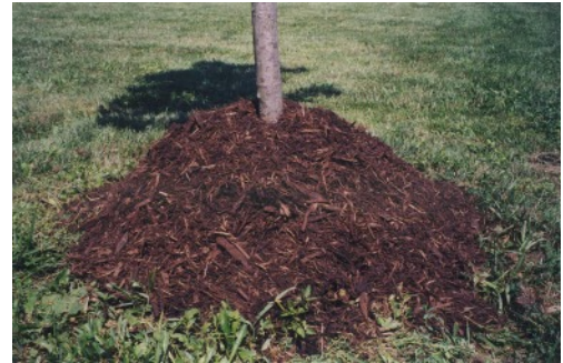
Creating mulch volcanos around trees softens bark and roots creating issues that may eventually kill the trees.

Instead of mounding, spread the mulch about 3 to 4 inches deep in a circle at least 3 feet in diameter around young trees and shrubs. Then brush away mulch at the center of the circle so that it is several inches from the base of the tree. This will allow the tree to stay healthy while suppressing weeds and retaining soil moisture.