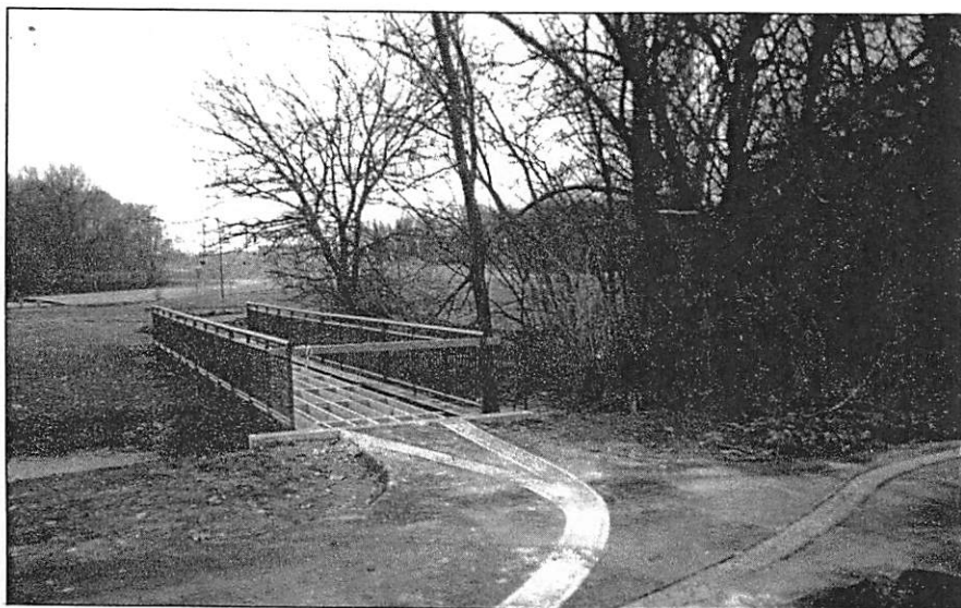
Improvements in the works for Brown Park include two bridges over Beargrass Creek. The 27.5-acre park is to reopen this spring.