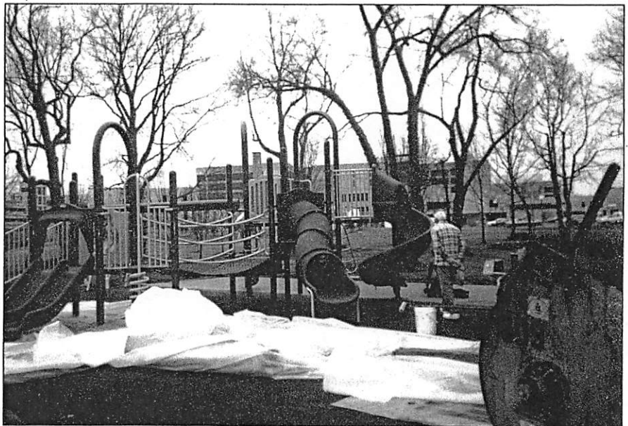
Signs of progress in the city's Brown Park project include a colorful new play set, a wildflower area and more than a mile of new paths.