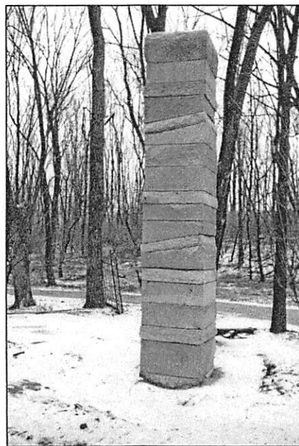
The layered columns in J. Graham Brown Park, which mark water levels recorded in historic floods, are made of limestone quarried in Southern Indiana.

To report a flooding problem, call 587-0603. MSD will send a letter explaining how the program works and how you can participate.