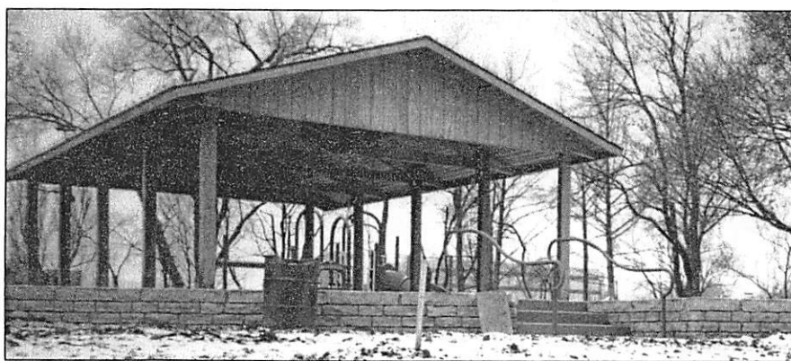
Features of the refurbished Brown Park include new stonework and paving around the pavilion and a colorful playground.

You will find one yard-waste sticker enclosed with this newsletter. If you need more, you can pick them up on the third floor of City Hall during business hours. Don't ask us to mail them to you — we cannot.