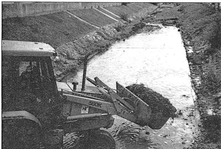
A Construction Department crew recently plowed into Weicher Creek near Dutchmans Lane, dredging silt from the creekbed.

Also in August, an LG&E spokeswoman told the council that the company's ambitious gas line replacement project was right on schedule.