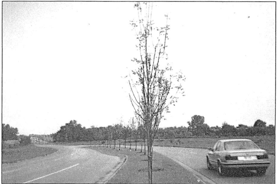
St. Matthews workers planted 267 Red Sunset maple trees last winter, including these in the median of Bowling Boulevard.

The city's biggest source of revenue ($2.67 million) is the .75-percent occupational tax on income and commissions earned in St. Matthews.