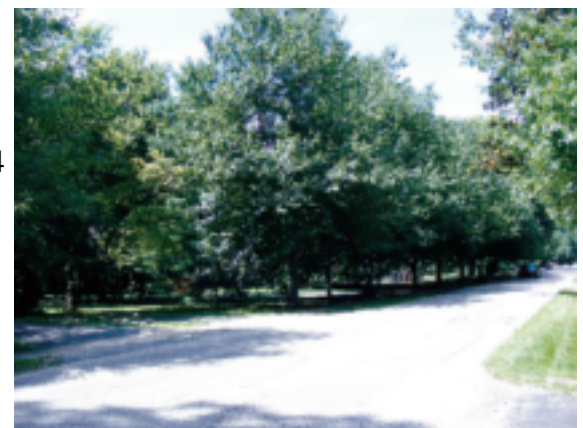
Mature trees planted years ago by the city now provide shade and protection from soil erosion.

front of their property in the right-of-way area by calling St. Matthews City Hall at 895-9444 or filling out the Contact Us form on the city's website at stmatthews.org . Since the city began tracking plantings in 2000, 1,476 trees have been planted with the species varying each year.