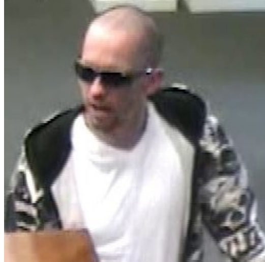
This is a surveillance photo of the suspect in the bank robbery case.

office thefts, where purses, wallets, and credit cards are being