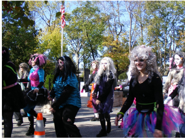
The "ghouls" put on a show for all the little "ghosts" and "goblins" in the last Halloween Festival.

noon. Bring out your little "ghosts" and goblins" for a wonderful and safe trick-or-treating experience! Following the Halloween