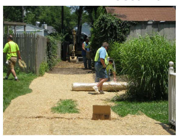
St. Matthews' Works Department personnel put in drains on Kentucky and Columbia Avenues.